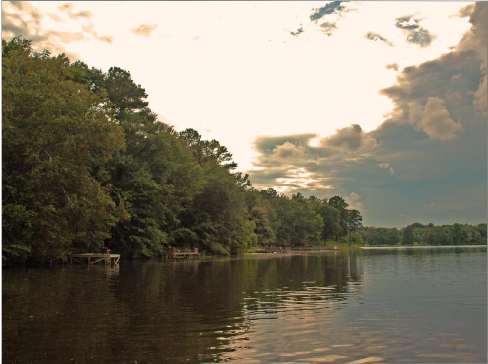
View of the Oconee River South of Dublin